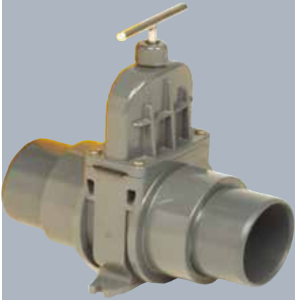
PVC inlet sluice valve DN 100 or DN 150, with pipe sockets bonded in, for the time-saving and space-saving direct connection to the inlet clamping flange.