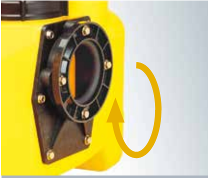
Height adjustable clamping flange compli 400